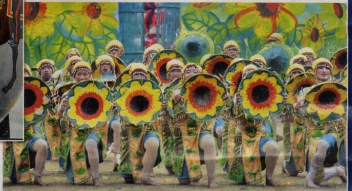
▼ Colourfully dressed participants in a street dance competition perform their routine at the flower-themed Panagbenga Festival in the Philippines