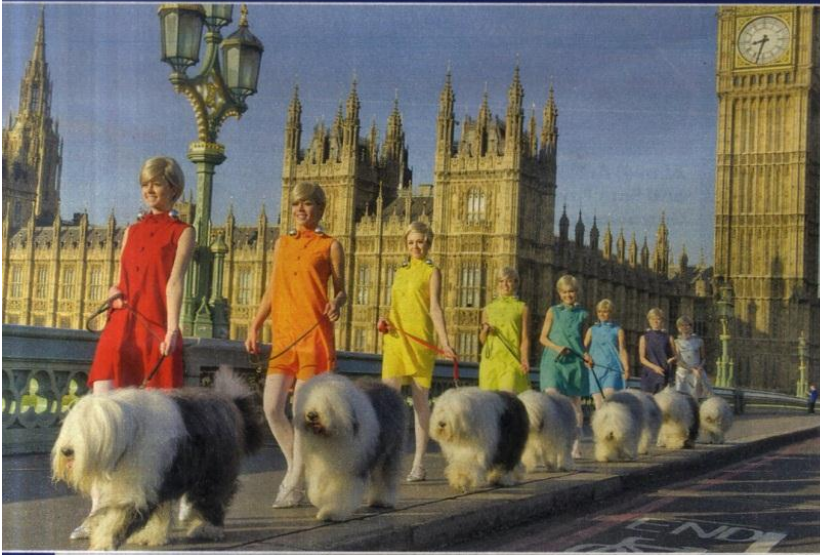
▲ Eight colourful models make their way past the Houses Of Parliament to celebrate Dulux being named one of the year's top ten Superbrands by the Centre For Brand Analysis, joining the likes of Rolex, Google and the BBC