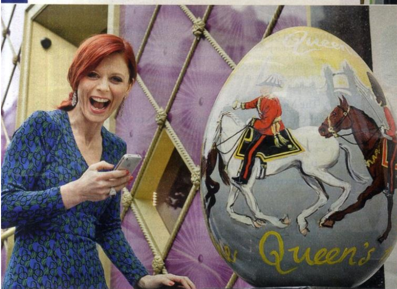
▲ Emilia Fox is supporting the Fabergé Big Egg Hunt, in which 200 eggs have been hidden in London for members of the public to find. The prize is a Diamond Jubilee Egg worth £100,000